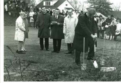
1960's groundbreaking of the education building.